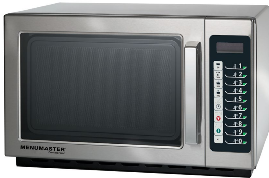
Model RCS511TS shown